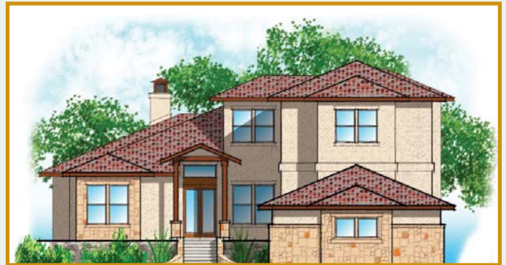
Above: Alternate elevations available for the Galicia Floorplan.

The two-story Galicia floorplan offers 3,724 square feet of living space, with an additional 458 square feet of covered porch. This spacious home is designed with family living in mind. Two bedrooms are located on the first level and two additional bedrooms, including a large game room, on the second floor. The convenient location of the stairway allows easy access to the second floor from the kitchen and the garage.